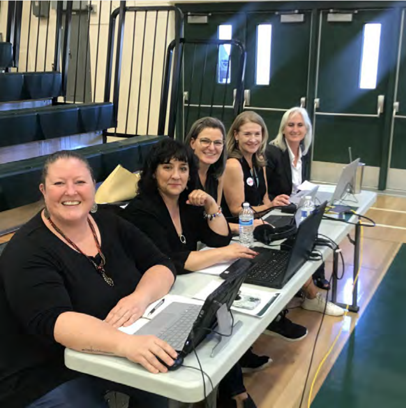
Los Alamos County Communications Team May 2022 – Cerro Pelado Community Briefing