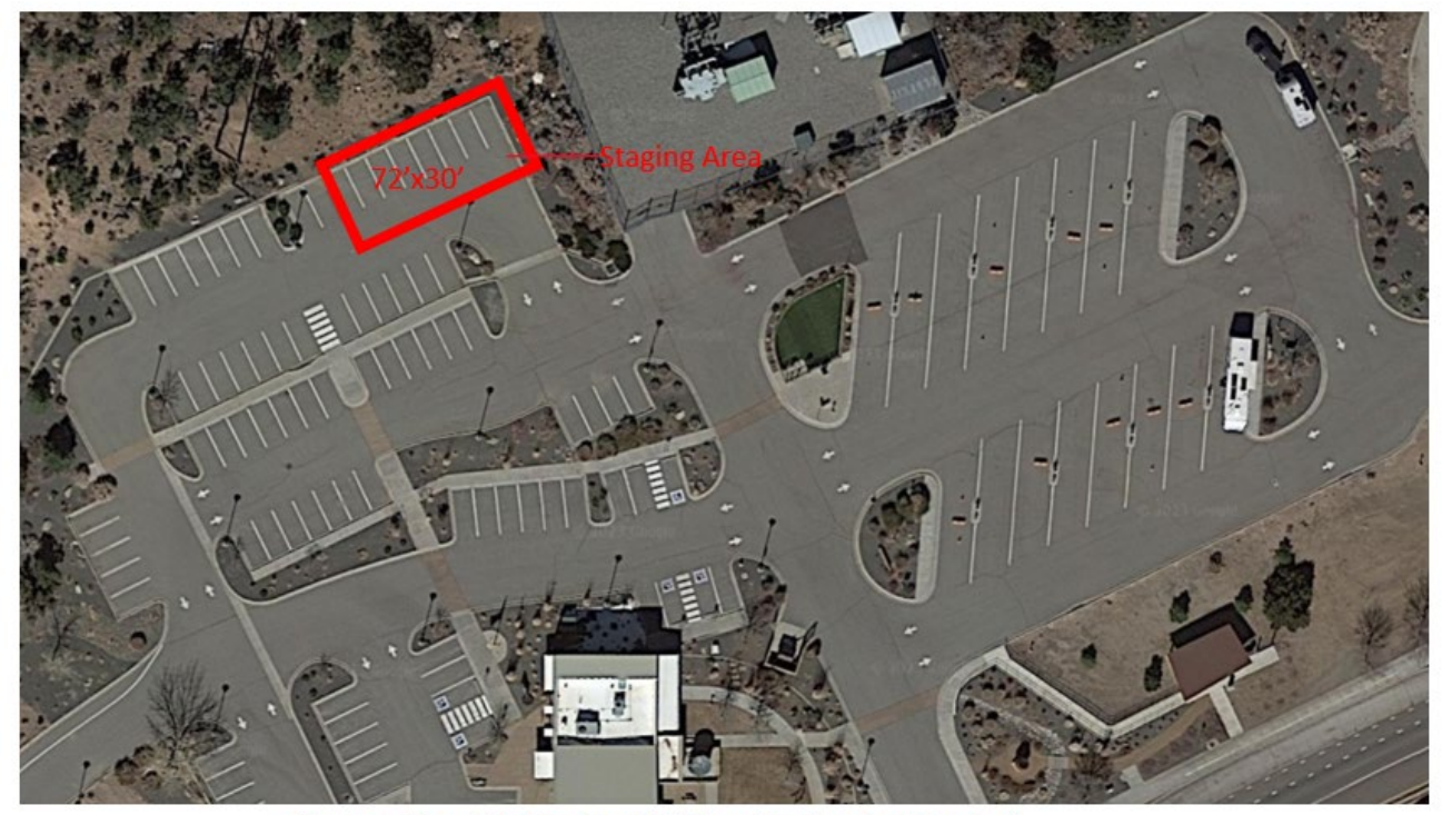
Staging Area White Rock Visitor Center Parking Lot 115 NM-4 White Rock N.M. 87547