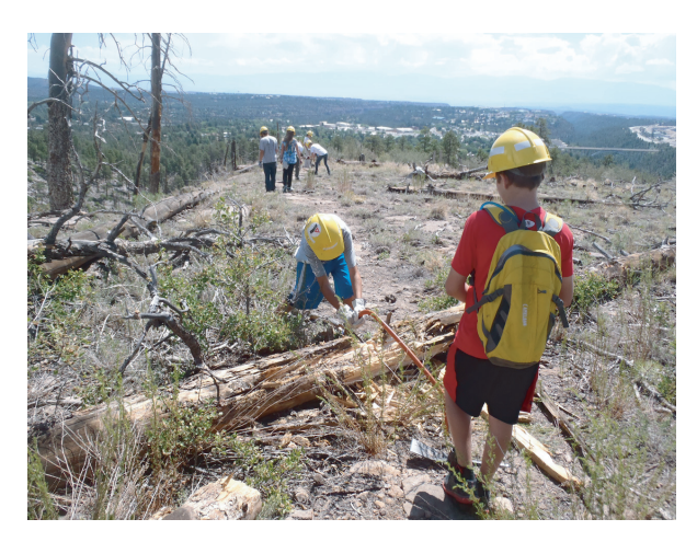
Participants in the Los Alamos Family YMCA Environmental Service Corps removing a fallen tree from the north rim trail segment.

The Satch Cowan Trail was designed from existing, boot-worn paths along with new segments developed to create a loop trail. Both rim routes have been used by Western Area residents and others for many years. As a school project-based learning experience designed to help students and the community recover from the Cerro Grande fire, sixth-grade students from Mountain Elementary rebuilt the Quemazon Nature Trail in 2000 and 2001. They moved on to improve the south rim trail in 2003, relocating the trail along the edge of Los Alamos Canyon to take advantage of views opened up by the fire. In 2012, a new group of sixth-graders built the missing segment to connect the trailhead with the south rim. The north rim route was improved in the summer of 2012 by the Los Alamos Family YMCA's Environmental Service Corps.