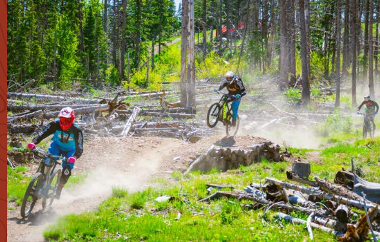
MOUNTAIN BIKING AT NEARBY PAJARITO MOUNTAIN