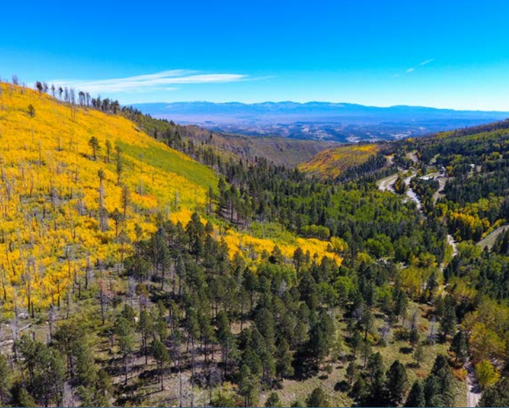
CAMP MAY IS A PRIME FALL LEAF VIEWING AREA