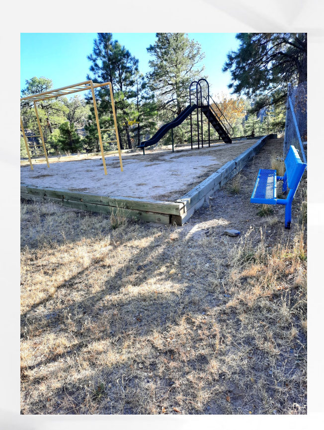
Route fails to connect to park amenities