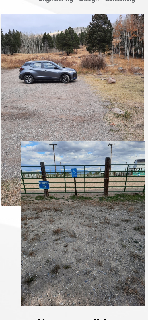
No accessible parking provided