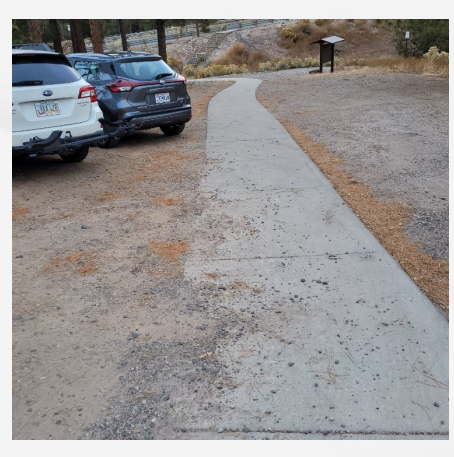
Loose gravel along path