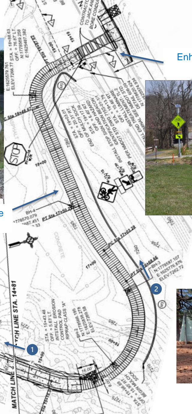
Enhanced Pedestrian Crossing