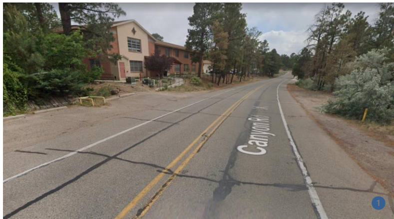
Raised Concrete Path