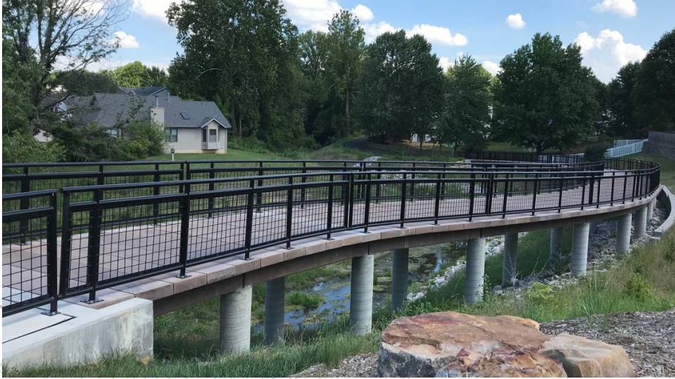
Precast Concrete Boardwalk