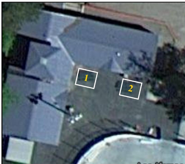
Outdoor Vendors Set-Up